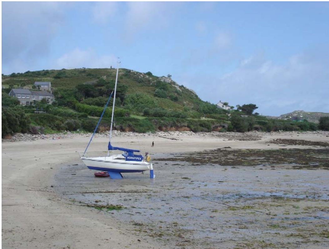
Hornpiper dried out on Bryher.

After the water receded we walked around the boat and dug in a fore and aft anchor plus another shoreline across the beach to keep us firmly in place when the tide returned. It is worth noting that the ground over there has a thin coating of sand making it look ideal for anchoring but it is only a few inches deep and underneath is very hard clay that a CQR just won't dig into. All the locals use either a fisherman's anchor or those four pronged spiky grapnel types that are usually home made. We had a hell of a job digging a hole deep enough to bury the 20lb CQR into with our bare hands and even some sharp pieces of wood we found. I made a mental note to always carry a small shovel on board after that!