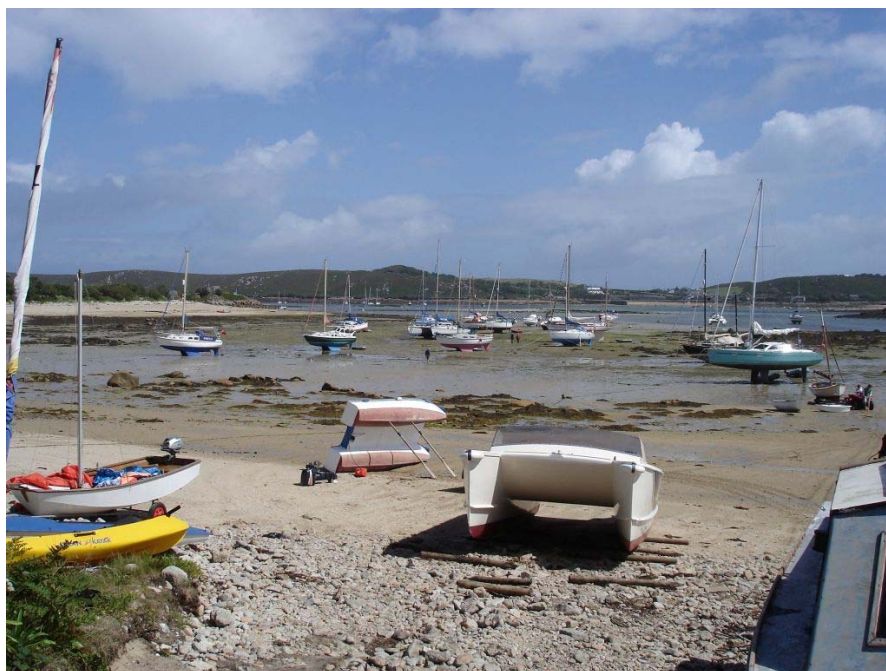
Green Bay on Bryher at low tide.

From a distance it was clear that Green Bay on Bryher was fairly full of boats but never the less we had to take a look. Sure enough it was quite crowded and difficult to find a nice spot close in with sufficient swinging room allowing some margin for the unknowns as to how each boat would lie when dried out. Further out towards the channel was too exposed for my liking with the wind as it was in the SW.