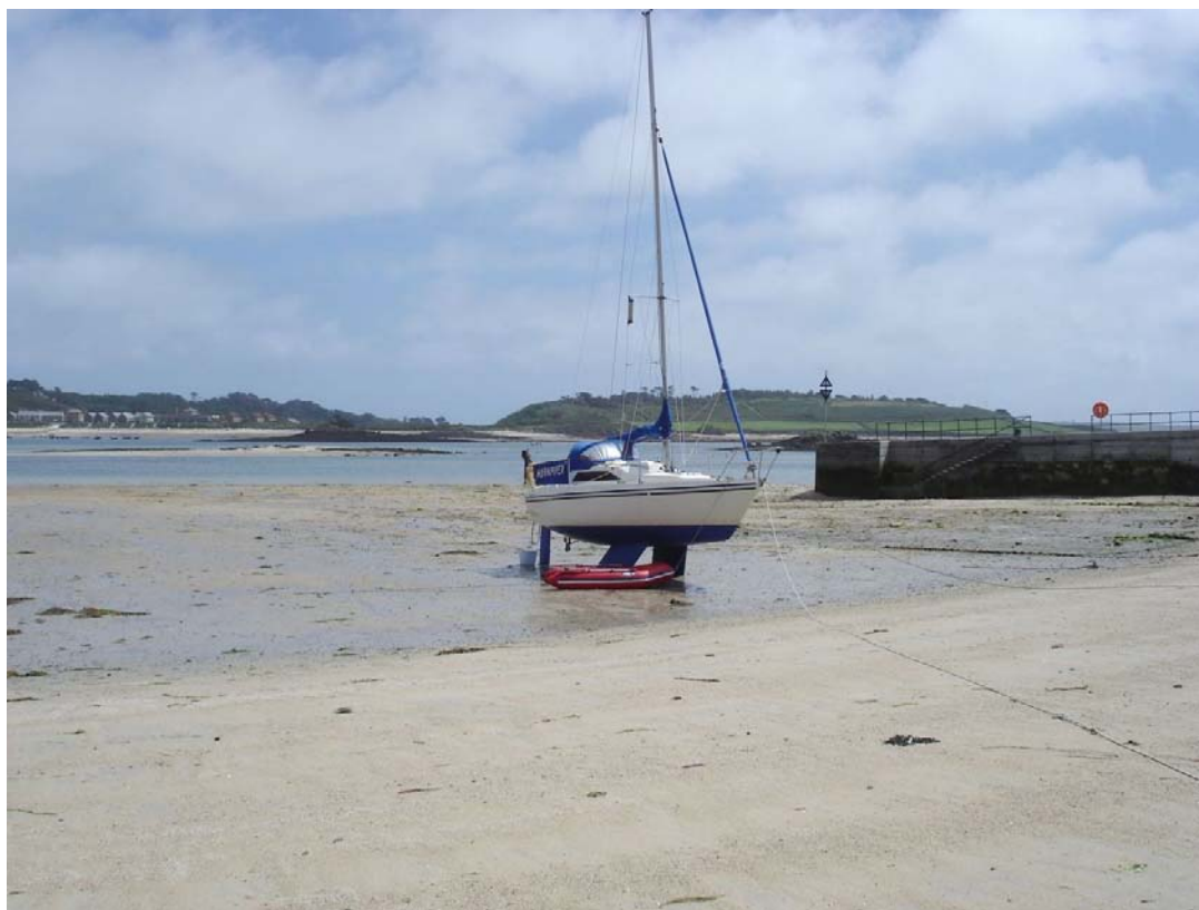
Looking across towards Tresco from the anchorage on Bryher.

minutes in the dinghy across to Tresco quay from there so we used the new Island Stores for our provisions and also walked over to Old Grimsby and around the south of the island past Carn Near.